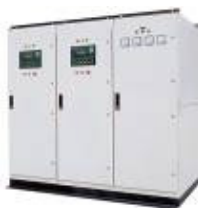
PLC-550 Parallel Control Panel system