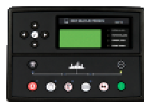
DSE 7420 Remote Control Panel